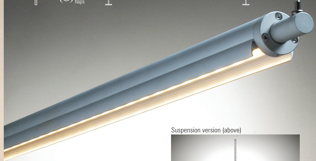
Suspension version (above)