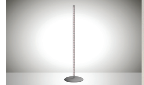
Floor mount base version

Each of the flaps can be locked using an Allen key